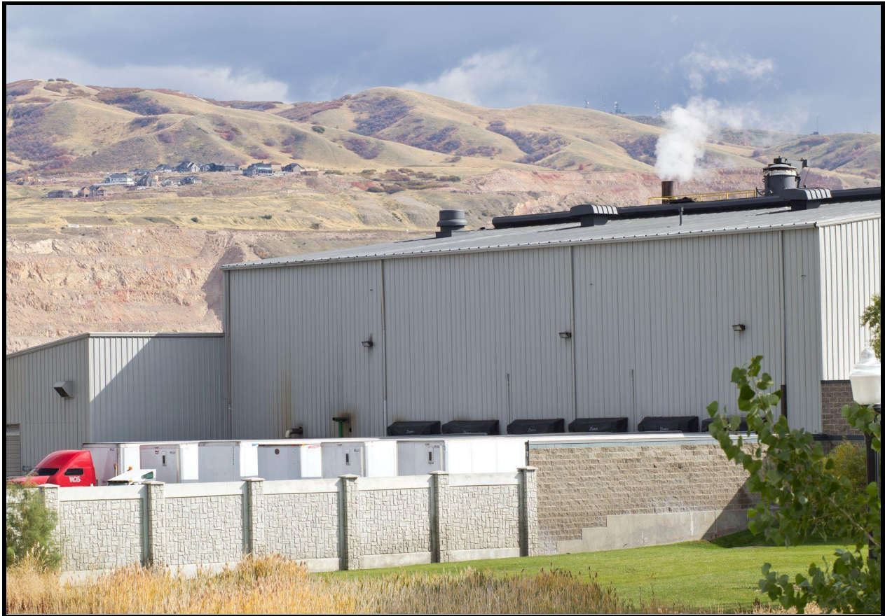
Stericycle, Inc.'s medical waste incinerator in North Salt Lake